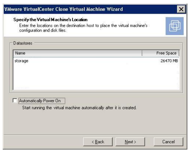
Figure 1: VC 1.4 – Uncheck "Automatically Power On"

1. Clone/Deploy a Windows VM and leave the "Automatically Power On" option in the Clone Virtual Machine Wizard unchecked, as in Figure 1 for VirtualCenter 1.4 or leave the "Power on the new virtual machine after creation" unchecked in VirtualCenter 2.0 as in Figure 2.