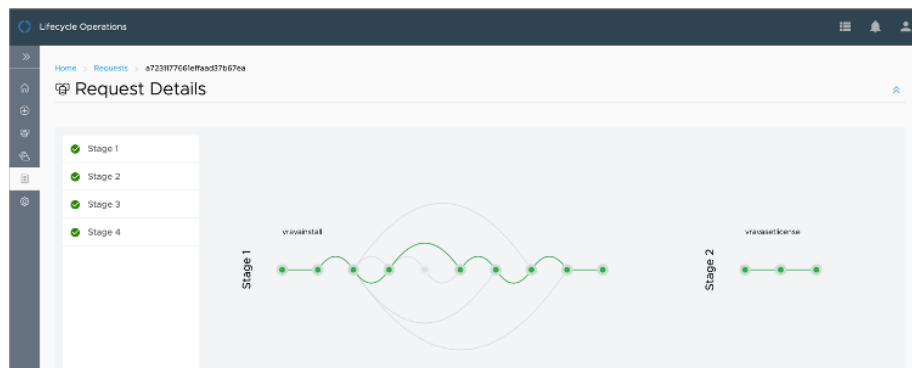
FIGURE 2: Easy installer showing progress through the stages of installation.